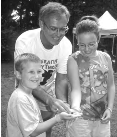
Preparing to release a banded hummingbird.

August is peak hummingbird season at the Nature Station (NS)! Hundreds of these beautiful birds visit our gardens each summer, making the Nature Station an ideal "outdoor laboratory" for studying these tiny winged gems.