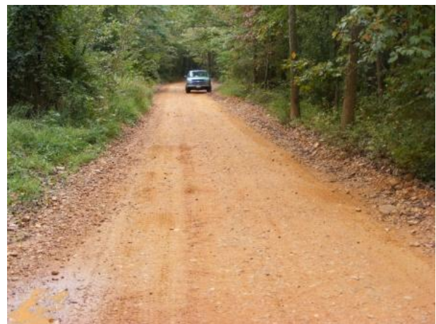
Recently reconstructed trail

was used to hire truck drivers and heavy equipment operators to reconstruct Turkey Bay trails. For six weeks, a predominately clay-based material was delivered, spread, and shaped to repair damaged and/or entrenched trails. Water bars, lead-off ditches, and other water diversion structures were also built to further guide rain water off the trails. Tread repairs have since been completed and the re-constructed trails are holding up better than ever. The next time you're out enjoying the trails, see if you can tell where the recent trail repairs took place. The "color" of the trail should give it away!