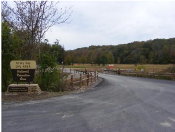
Entrance to Turkey Bay gets a face-lift

Creek. That spring, a new vault toilet and information kiosks were constructed near the gatehouse. The bridge and its transition off The Trace were recently paved as well. Volunteers installed nearly 500 feet of split-rail cedar fencing to accommodate the new pavement and mirror the look of the kids' Turkey Trot area. Last but not least, a stone sign base similar to those at the Golden Pond Visitor Center and Elk & Bison Prairie has been constructed near The Trace to welcome all visitors.