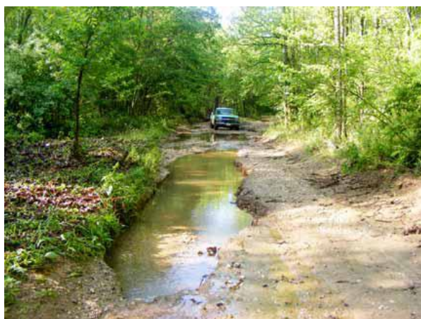
Trail damage resulting from heavy rains

Not long after ice storm clean-up efforts subsided, Turkey Bay was hit once again by an unexpected weather related closure. Heavy rains over a 36-hour period caused Turkey Creek to breach its banks, severely scouring the trail in many areas. Large washouts posed serious safety issues and compromised trail integrity. Since many other trails and legal roads in LBL were in the same condition, the decision was made to be proactive and not only repair the damages but improve the trails to prevent similar disasters in the future.