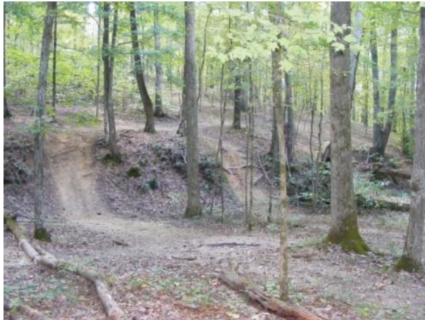
Area shown is before hillside restoration

In order to keep progressing toward a more sustainable trail system, hillside restoration efforts continue in Turkey Bay. Watershed improvement is the underlying objective of the current restoration projects. All work sites are located in Turner Hollow Watershed, which encompasses 1,233 acres of Turkey Bay, and is considered threatened because of soil make-up, proximity to Kentucky Lake, acres being drained, and overall visitor use. According to LBL's Land and Resource Management Plan, two watersheds must show improvement over a ten year span. This goal will simultaneously aid the long-term sustainability of the trail system and ensure future riding.