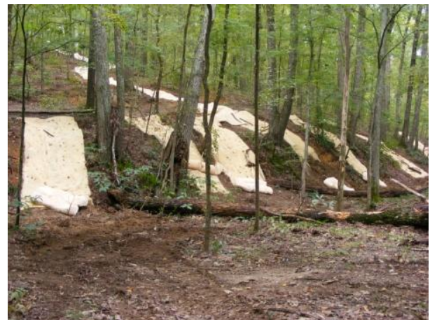
Restoration efforts using biodegradable mats

covered with biodegradable mats, downed trees, and brush. These mats not only serve as cover for the newly prepared seedbed, but also allow water to percolate into the soil. This year, over 22,000 square feet of sediment mats have been installed, more than 250 pounds of seed have been sown, and 26 acres of formerly de-vegetated hillsides have begun a transition back into ground cover. It is important that all vehicles refrain from entering these areas, as any disturbance could dislodge the sediment mats and logs compromising seedbed viability. Riding responsibly will ensure future use of the trail system. Thank you for your cooperation.