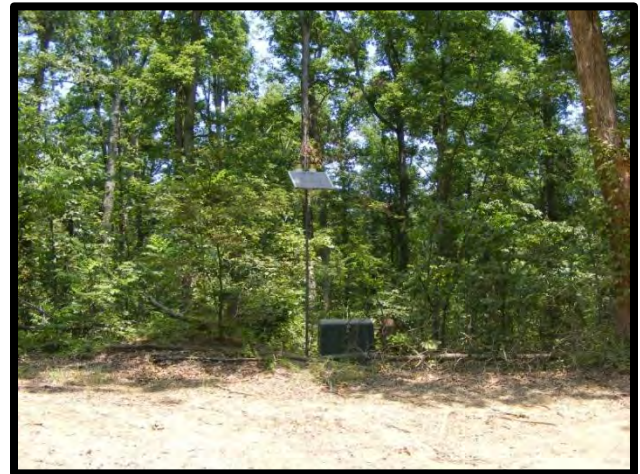
Turkey Bay Weather Station

The intent behind this station was to not only report accurate weather readings, but also supply accurate soil moisture readings as well.