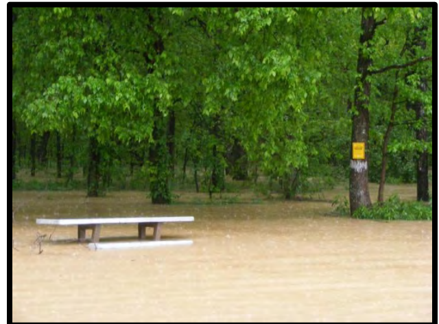
Camping Area at Turkey Bay During Record Flood

Due to the increased rain and snowfall coupled with frequent freeze/thaw action and spring flooding, Turkey Bay was closed for 68 days between January and May.