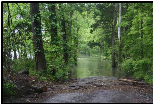
Entrance Road with Debris and Flood Waters

While temporarily inconvenient, it is important to remember that these trail closures are intended to protect the long-term sustainability of the sport we all enjoy by promoting responsible trail riding etiquette and protecting trail condition integrity. Hopefully, Mother Nature will calm down long enough for us to enjoy the trails without interruption for a while.