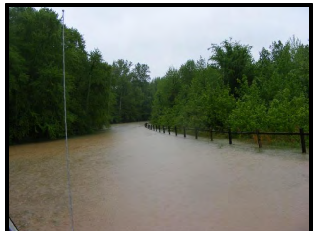
Kid's Trail with Several Inches of Standing Water

During the first week of May, LBL experienced record high lake levels of 373.5'. (Summer pool is 359'.) This record flooding left the kid's trail submerged and debris deposited across many low lying trails. Cleanup efforts were completed quickly, but the remnants of the flood are still visible.