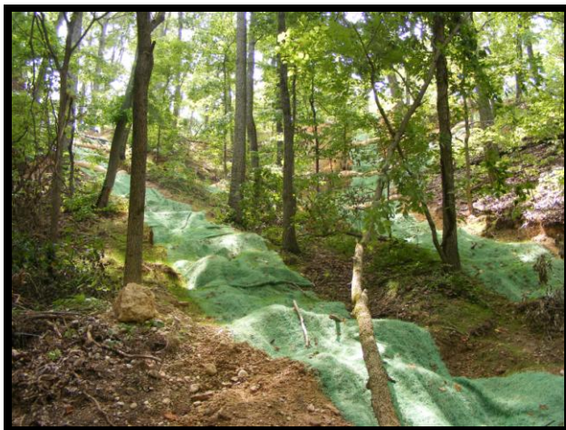
Restoration Area near Point 5

This year's hillside restoration efforts were completed in late September 2010. Crews were very productive, even through 30 consecutive days of temperatures above 90 degrees. They managed to install 5.2 miles of erosion control blankets, sow over 1,000 pounds of warm and cool season grass seed, and rehabilitate a total of 73 acres in two different watersheds.