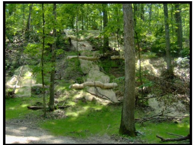
Restoration Area near Point 2

respectful and not damage or destroy any vegetation within the restoration areas. These restoration efforts were funded through Forest Service Region 8 Legacy Roads and Trails Remediation Initiative and will hopefully be an integral part of Turkey Bay's sustainability in the long run.