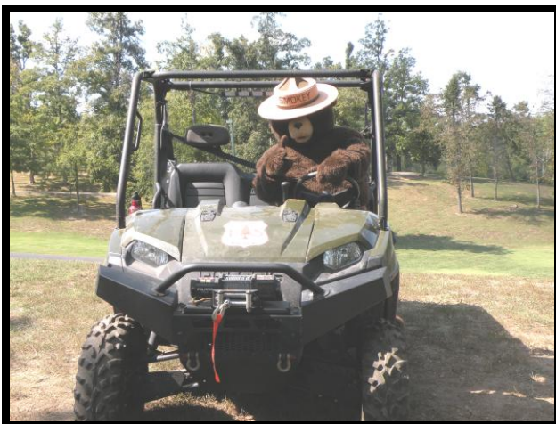
Smokey says, "Only You Can Prevent Wildfires!"