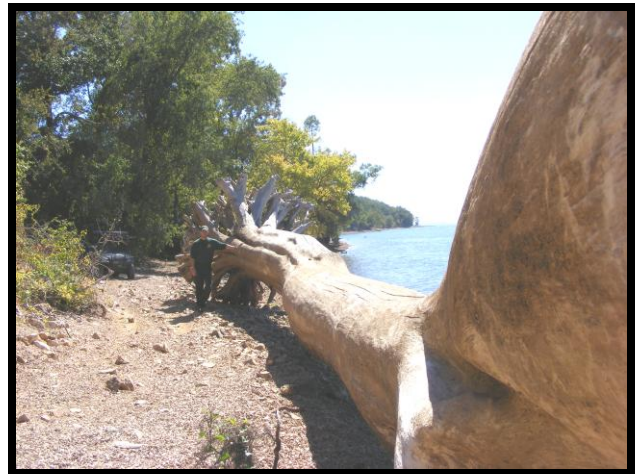
Driftwood washed up on shoreline from 2010 Flood

Like most other rivers and streams in the region, the Tennessee River and Cumberland River swelled to record stages in May 2010. Heavy rainfall in middle Tennessee compounded the amount of rain LBL received and significant flooding resulted across the region, including LBL.